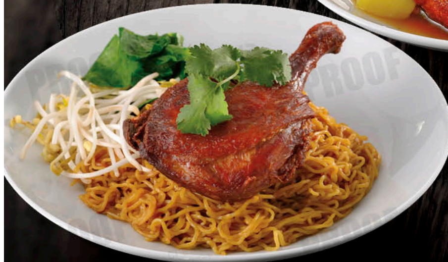
EGG NOODLES WITH ROASTED DUCK (DRY)