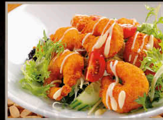
CRISPY PRAWN SALAD