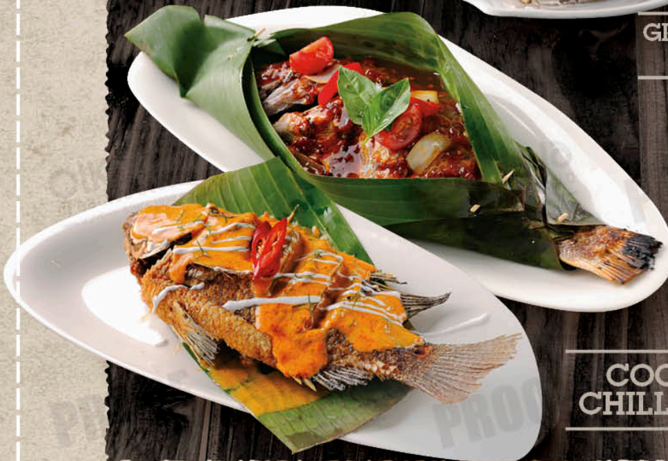
CHILLI & TAMARIND SAUCE