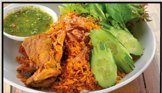
KHAO MOK GAI

Deep fried soft shell crab seasoned with salt & pepper, garlic & chilli