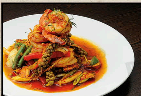
MIXED THAI HERBS

69. Pad Prik Khing (!) Homemade chilli paste stir fried with bean, capsicum, onion & kaffir lime leaves