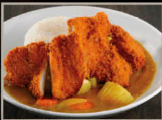
JAPANESE STYLE FRIED CHICKEN CURRY WITH RICE