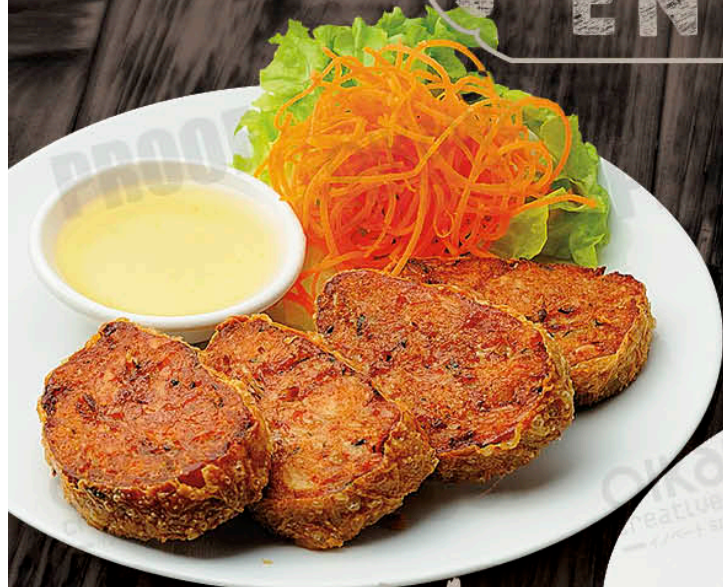
Deep Fried HOY JOR