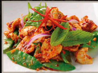
CHICKEN SNOW PEA SALAD