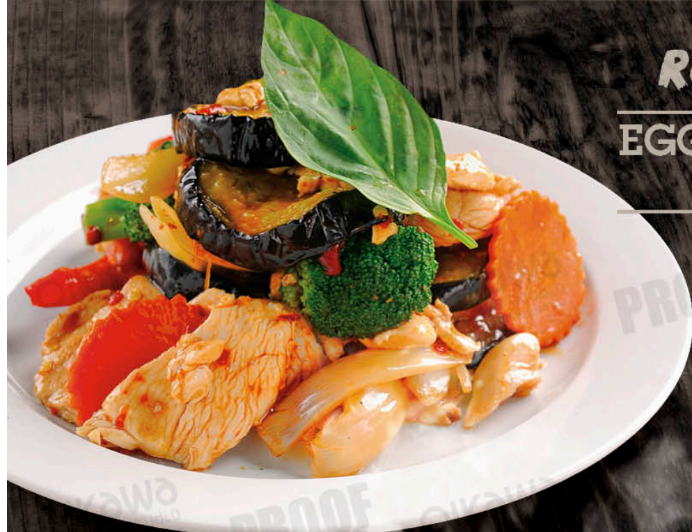
Roasted EGGPLANT & BASIL