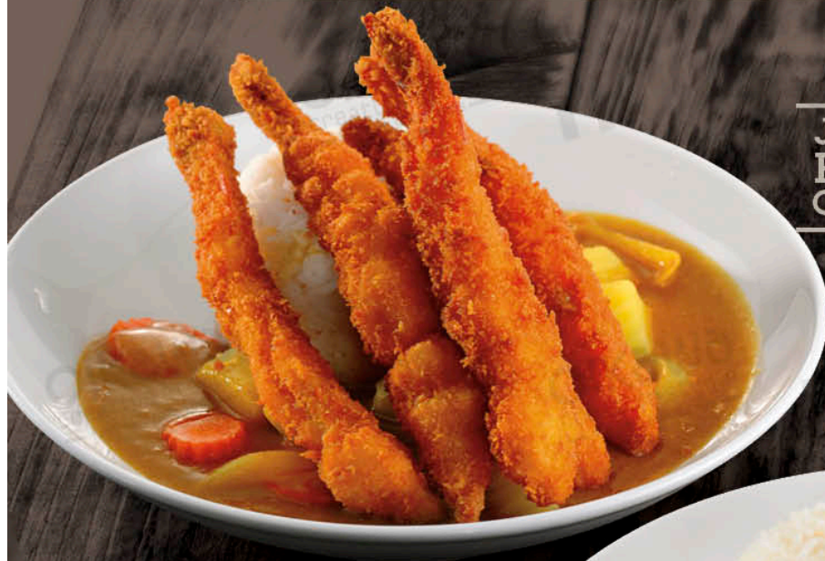
JAPANESE STYLE FRIED PRAWNS CURRY WITH RICE