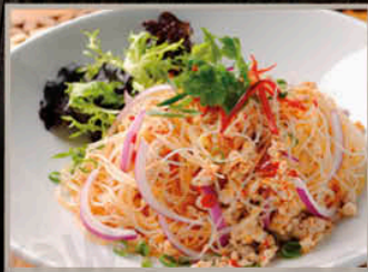
YUM WOON SEN