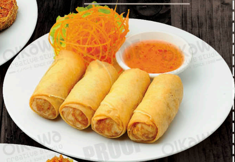
ITFT style SPRING ROLLS