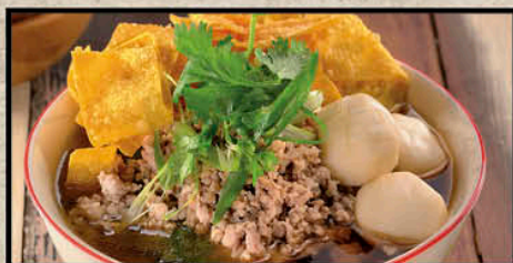
CHICKEN NOODLES SOUP

97. Duck Noodles Soup Thai style slow cooked soup with roasted duck, bean sprouts, Chinese broccoli & thin rice noodles