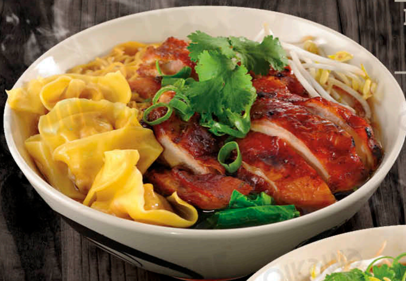
BBQ CHICKEN & WONTON NOODLES SOUP