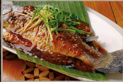
GARLIC & GINGER SAUCE