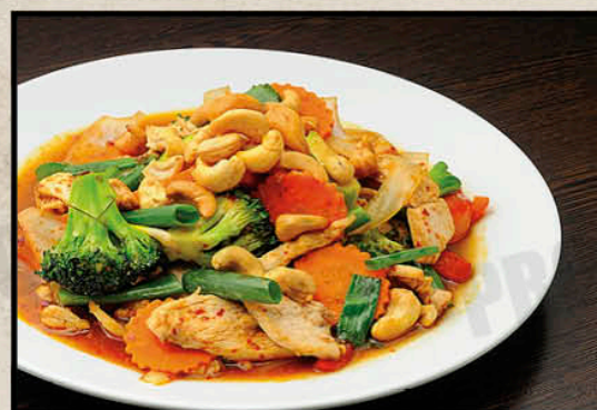
CASHEW NUT WITH CHILLI JAM

70. Satay Stir Fried Stir fried mixed vegetable & topped with homemade peanut sauce