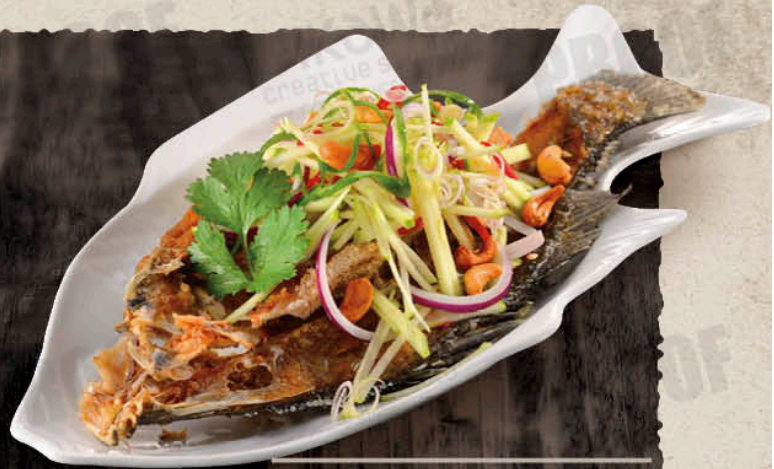
GREEN APPLE SALAD & CASHEW NUTS