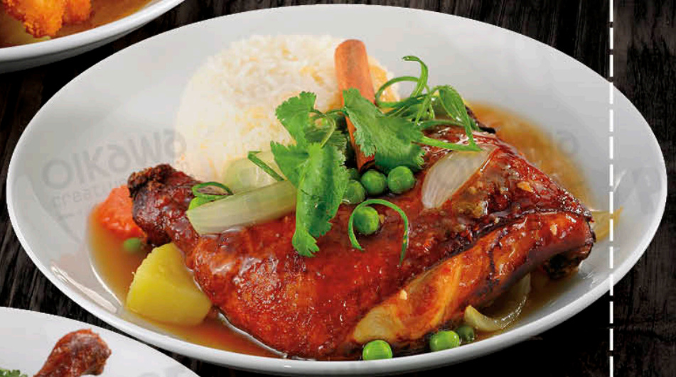
CHICKEN STEWED WITH RICE