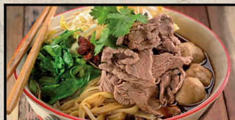
BEEF NOODLES SOUP

HEAT INDICATOR : ! Mild - !! Medium - !!! Hot