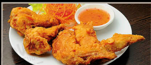
DEEP FRIED CHICKEN WINGS