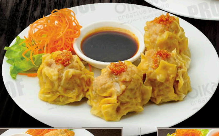
Steamed CHICKEN DIM SIM