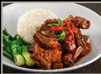
BRAISED BEEF RIBS WITH RICE