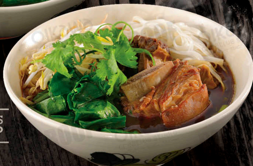
BRAISED BEEF RIBS NOODLES SOUP

101. Japanese Style Fried Prawns Curry with Rice ..... $20