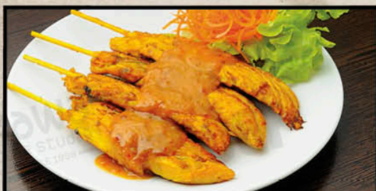
SATAY CHICKEN BREAST

Minced chicken, water chestnut & corn wrapped with spring roll pastry & deep fried served with sweet chilli sauce