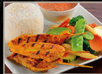
SATAY CHICKEN SKEWERS & VEGETABLE WITH RICE